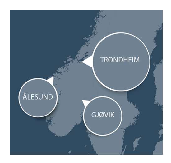
Figure 2.1: The map shows the three main campuses of NTNU.